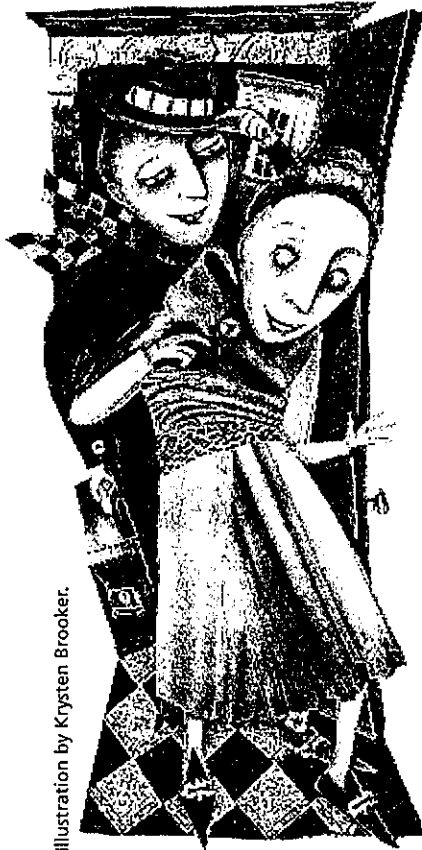
Illustration by Krysten Brooker.