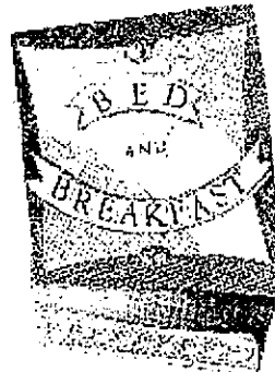
Illustration by Krysten Brooker.